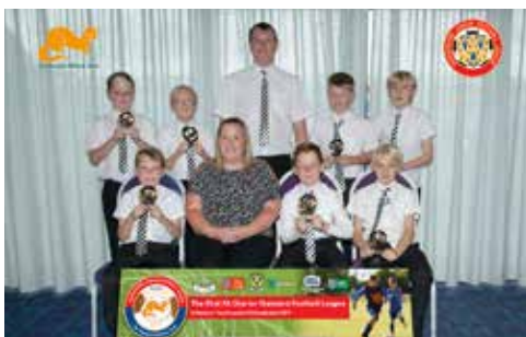
Under 10 winners (sponsored by Sportsjam) – Shawbury United Juniors