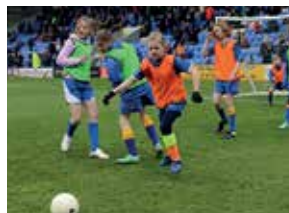
Regional Talent Club for Girls