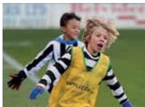
Game Play & Skillz Centre