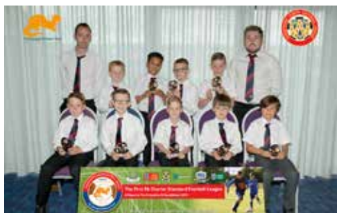
Under 9 winners (sponsored by Sportsjam) – Shrewsbury Juniors

SJFL provided a ninth and successful Futsal Respect Festival for U7/crèche to U10's at Shrewsbury Sports Village with over 70 teams and 700 plus players participating. The festival is all about player development and respect in the game and the following respect team awards were presented: