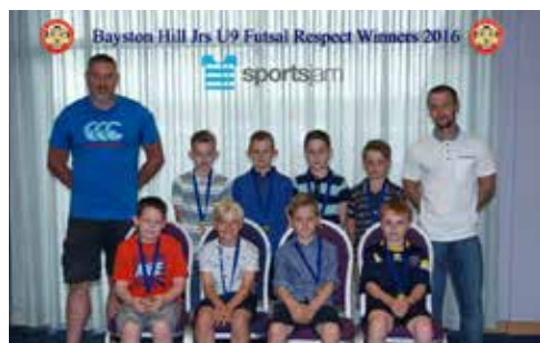
Under 9 winners – Bayston Hill Juniors.

The SJFL's 2016 Futsal Respect Festival is now in its eighth year and with 62 teams entered and over 600 participants this is the most successful event ever! The respect winners are sponsored by Sportsjam and Kidz in Focus produce the programme as official photographers to the league. Futsal is a key enabler for player development and the league uses the event to promote respect in the game. Respect winners are awarded for each age group U8, U9 and U10 decided through respect match reports - players, managers/coaches and their supporters after each game/day of the tournament. The winners are listed above and received their awards at the league's Presentation day held at Grenhous Meadow Stadium.