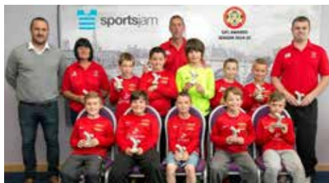
U10 Futsal Respect Winners – Whitchurch Alport Juniors.