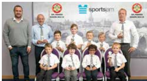
U8 Futsal Respect Winners – Shawbury Hawks.

The SJFL's Futsal Respect Tournament is now in its seventh year and this year 53 teams entered with over 500 participants making it the most successful yet. The event is sponsored by SportsJam and Kidz in Sports produce the programme as official photographers to the league. Futsal is a key enabler for player development and the league uses the event to promote respect and fairplay in the game. Respect winners are awarded for each age group U8, U9 and U10 and this is decided through match reporting of players, managers/coaches and their supporters after each game/ day of the tournament. The winners are listed above and received their awards at the league's presentation day.